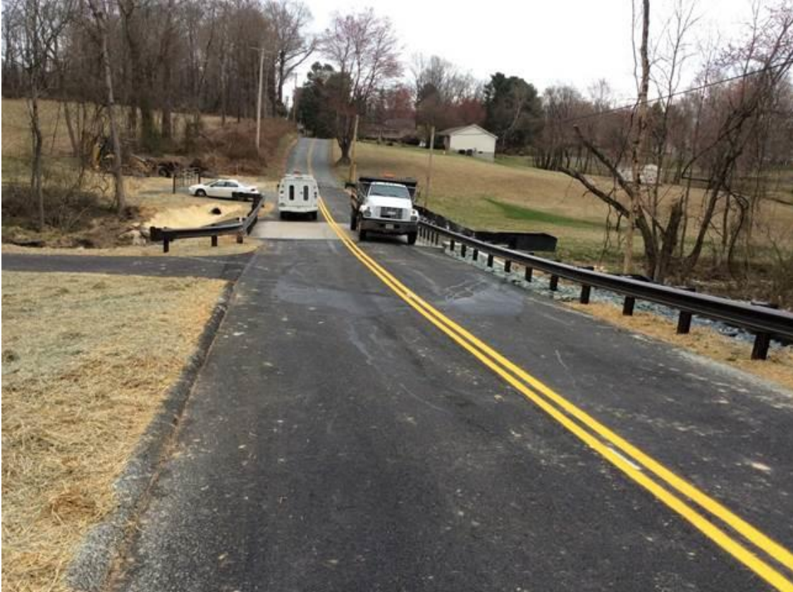
Snake Lane Bridge reopened